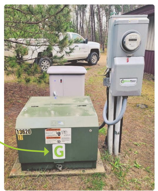
cooperative's power isolated from each other, as well as letting us know so that together we can keep our lineworkers safe!

How can you prevent back feeding? The simple answer is to always keep generated power and the