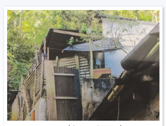
A typical home in Guatemala.

For more information on Guatemala, visit www.helpsintl.org.