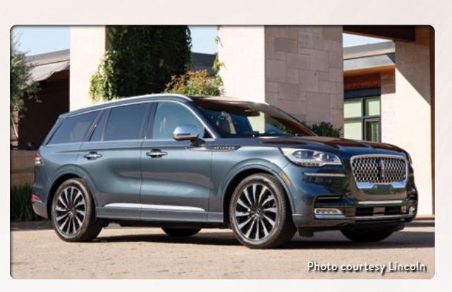
2020 Lincoln Aviator Grand Touring ☐ Plug-in Hybrid SUV/Crossover