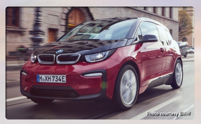
2020 BMW i3