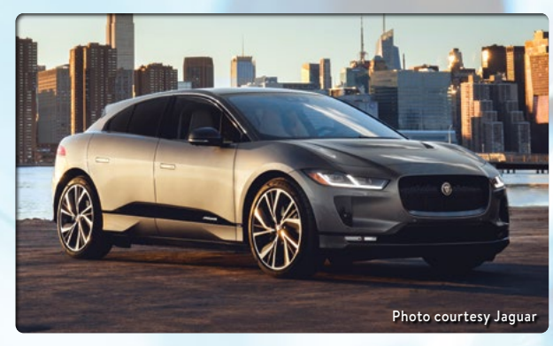
2020 Jaguar I-Pace