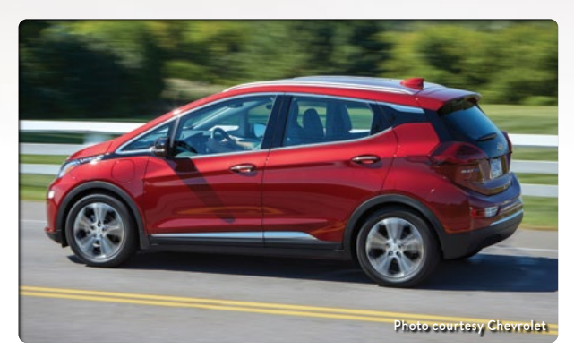
2020 Chevrolet Bolt EV **Battery-electric Compact/Hatchback

EPA electric range: 259 miles Range/hour of charging: 26 miles Fast charging: 100 miles in 30 minutes