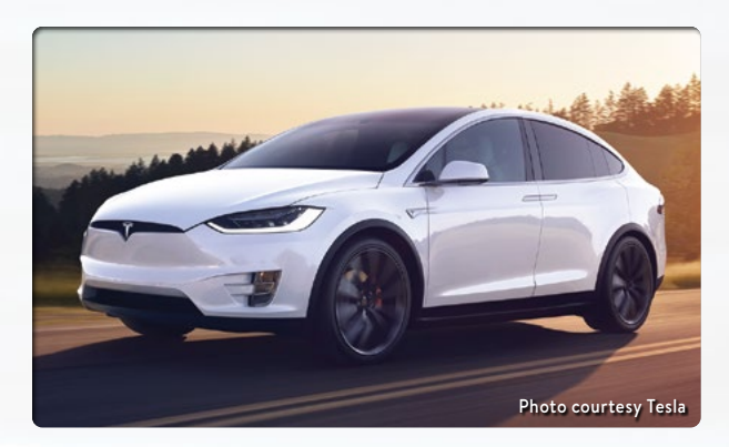
Tesla Model X <sup>™</sup> Battery-electric SUV/Crossover

EPA electric range: 258-328 miles Range/hour of charging: 28-41 miles Fast charging: Up to 115 miles in 15 minutes