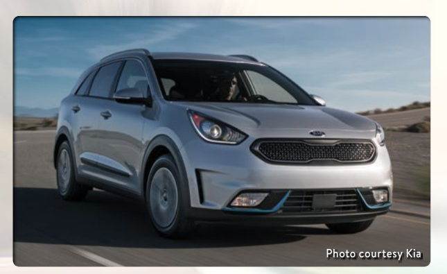
2020 Kia Niro Plug-in Hybrid

EPA total range (gas+electric): 460 Range/hour of charging: 8 miles Starting MSRP: $68,800