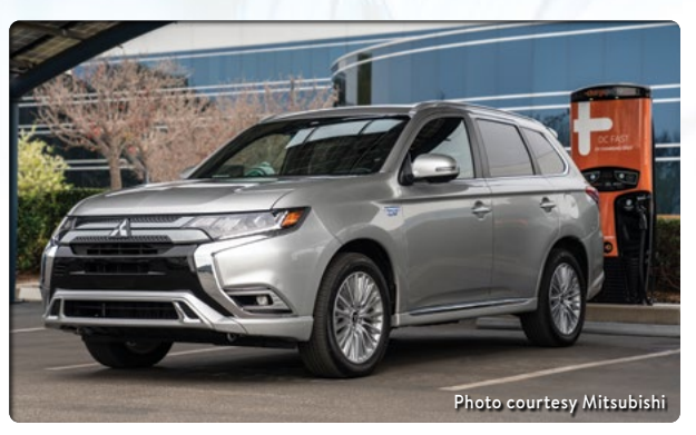
2020 Mitsubishi Outlander Plug-in Hybrid Plug-in hybrid SUV/Crossover