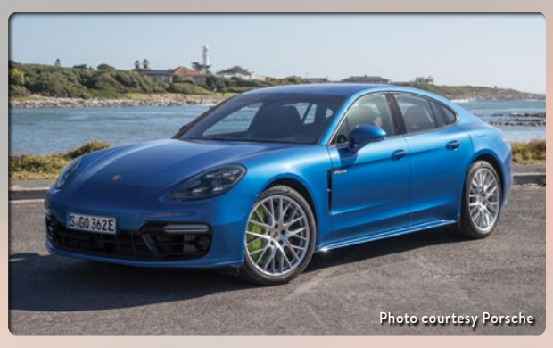
2020 Porsche Panamera 4 E-Hybrid