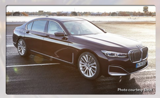
2020 BMW 745e xDrive iPerformance ☐ ♥ Plug-in hybrid Sedan