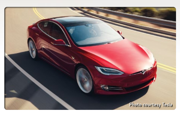
Tesla Model S t□ Battery-electric Sedan

EPA electric range: 287–373 miles Range/hour of charging: 31–46 miles Fast charging: Up to 130 miles in 15 minutes