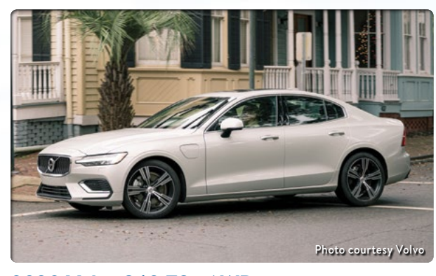
2020 Volvo S60 T8 eAWD