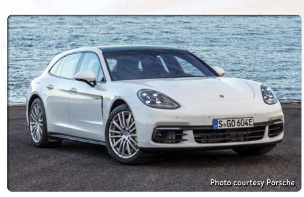
2020 Porsche Panamera 4 E-Hybrid Sport Turismo

Range/hour of charging: 5 miles Starting MSRP: $103,800