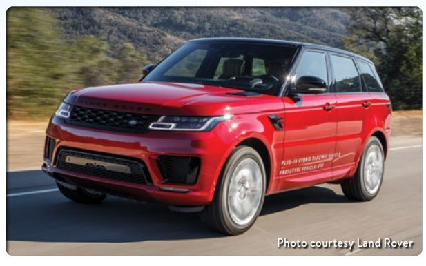
2020 Land Rover Range Rover Sport PHEV ☐ ♥ Plug-in Hybrid SUV/Crossover