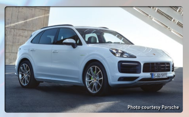
2019 Porsche Cayenne E-Hybrid