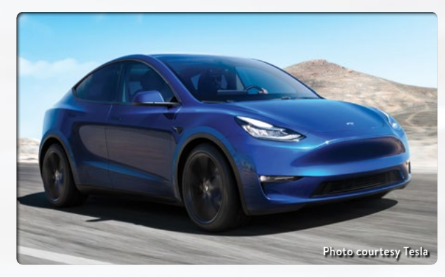
Tesla Model Y <sup>™</sup> <sup>™</sup> Battery-electric SUV/Crossover

EPA electric range: 315 miles Range/hour of charging: 31 miles