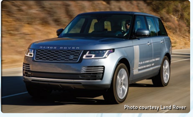
2020 Land Rover Range Rover PHEV