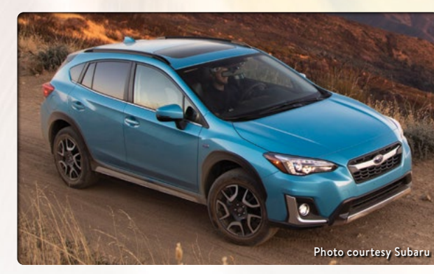
2020 Subaru Crosstrek Hybrid