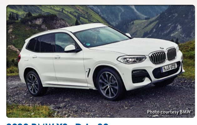
2020 BMW X3 xDrive30e ☐ ♥ Plug-in hybrid SUV/Crossover