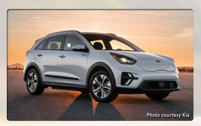
2020 Kia Niro EV