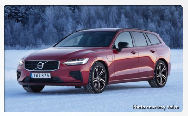
Volvo V60 T8 eAWD