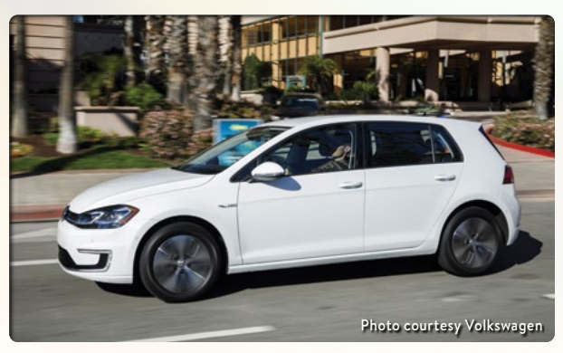
2020 Volkswagen e-Golf