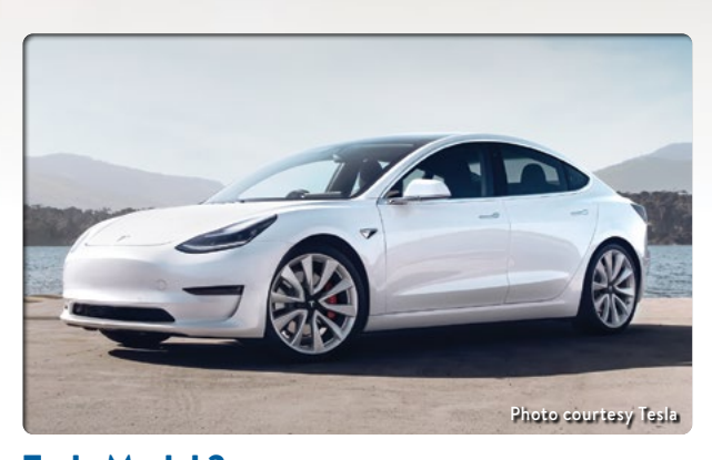
Tesla Model 3 <sup>™</sup> Battery-electric Sedan

Range/hour of charging: 5 miles Starting MSRP: $107,800