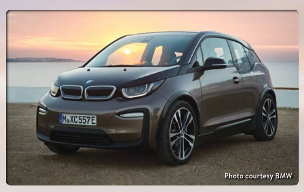
2020 BMW i3 REx