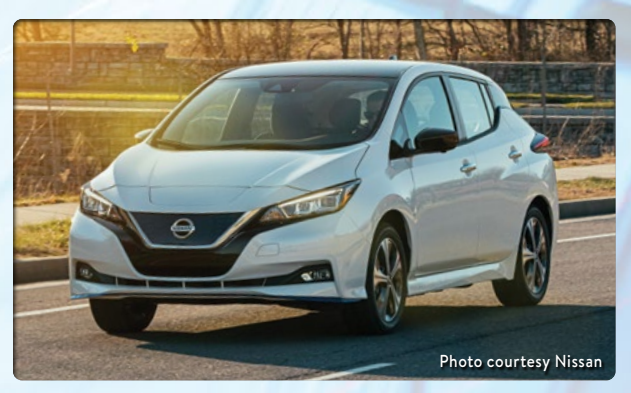
2020 Nissan Leaf and Leaf Plus