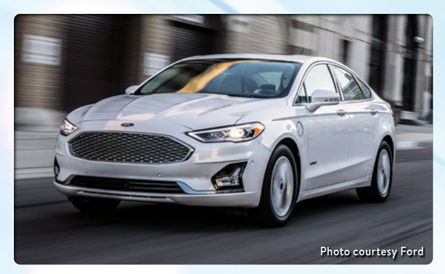
2020 Ford Fusion Plug-in Hybrid