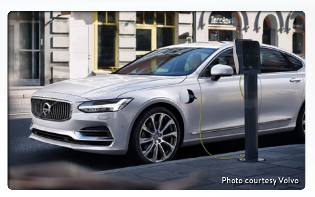
2020 Volvo S90 T8 eAWD