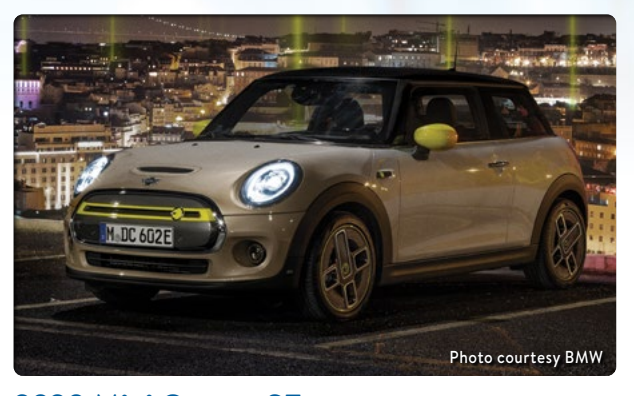
2020 Mini Cooper SE

EPA total range (gas+electric): 480 Range/hour of charging: 6 miles Starting MSRP: $79,000