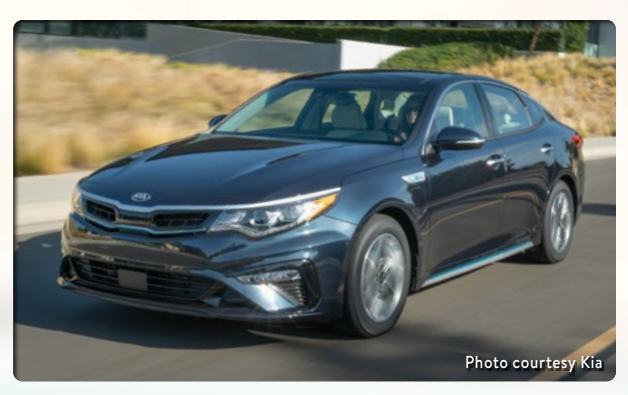
2020 Kia Optima Plug-in Hybrid

EPA electric range: 26 miles EPA total range: 560 miles Range/hour of charging: 11 miles Starting MSRP: $28,500