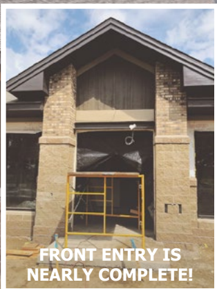
FRONT ENTRY IS NEARLY COMPLETE!

Construction on the new headquarters building continues to progress well. Windows have been installed, insulation is in place, mechanical and electrical work is in progress, and sheetrocking is underway now. Outside the building, the block work in front is almost complete , siding and soffits are done, and concrete pours for curbs and sign foundation are being finished up. The project should be fully completed before the end of the year.